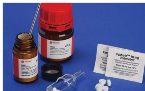
Picture 2 ..... Solid Standards

Just call us! We'll be pleased to answer any questions regarding sample analysis using the Karl Fischer method and on HYDRANAL reagents. Or visit us at sigma-aldrich.com/hydranal .