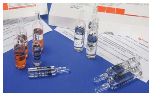
Picture 1 ..... Liquid HYDRANAL-Water Standards

Opening an ampoule directly before a measurement reduces the risk of atmospheric moisture entering the ampoule and falsifying results (depending on local humidity conditions). We recommend the use of glass syringes since most plastic syringes can store or release a certain amount of water over time. It is common practice to flush each syringe before use with approximately 1 mL of HYDRANAL-Water Standard, then draw the whole remaining volume into the syringe. This will reduce exposure of the standard to atmospheric moisture.