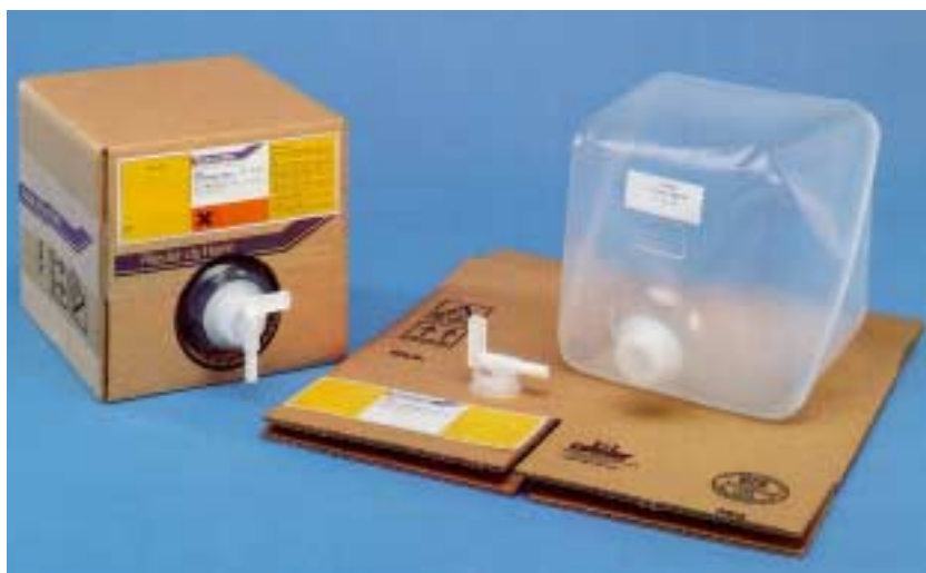
Figure 3: 10 l VOLPAC® container

Many chemical and biological reactions depend on the concentration of hydrogen ions. In research and technology, it is important to know, and to adjust the pH value for a desired reaction. The pH value is stabilized against acid and alkaline influences by adding buffer substances or buffer solutions. Buffer substances are generally mixtures of weak acids and bases with their salts or the salts of multi-alkaline acids. By dissolving these buffer substances in water free of salts and carbon dioxide, buffer solutions are created whose pH values are reproducible and which remain stable for long periods even after the addition of substances which cause acid or alkaline reactions. The compensating reaction