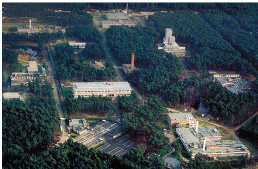
Figure 2: The site of the IRMM institute in Geel, Belgium

Each certified reference material is provided with a comprehensive certificate of analysis stating the certified values along with the associated measurement uncertainty for each certified value. In addition to the certificate the certification report is delivered with each product which provides details on the production, characterization and certification of the material.