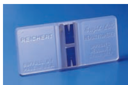
Bright-Line™ Hemacytometer (Option C) Z359629