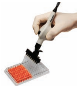
HandVac handheld aspirator (Option D) Z688169