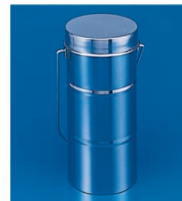
Wide-mouth Dewars (capacity 2L) (Option E) D4295