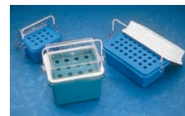
Nalgene® Laptop cooler (Option B) C2437