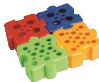
Interlocking Puzzle Rack for 1.5/2.0, 15 and 50ml tubes (Option A) Z692972