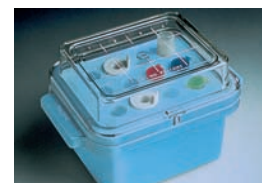
Quick Chill™ cooler (Option C) Z359068