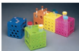
Cube rack, assorted colors (Option B) C8358