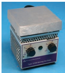
Thermolyne® midget stir plate (Option D) Z111155