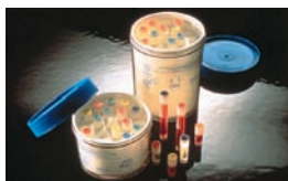
Freezing container, Nalgene®, Mr. Frosty (Option A) C1562