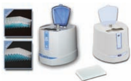
Labnet MPS 1000 Mini Plate Spinner (fixed angle rotor, AC input 120V) (Option E) Z723533