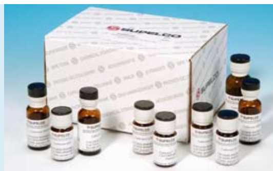
Figure 1 ..... Carbon Molecular Sieve Kit

... describes the past, present and future of carbon adsorbent research at Supelco.