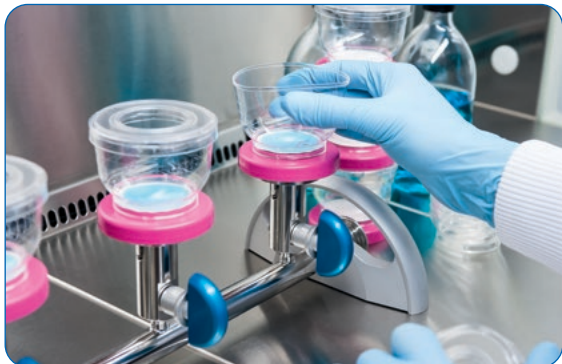
One handed funnel removal

Quick-fit connections for the vacuum tubing and a low manifold level make sterile filtration more convenient than ever before. The special filtration head for fitting the EZ-Fit® filtration unit allows the funnel to be removed with only one hand. The EZ-Fit® manifold's interior is easy to access for cleaning, so you can be confident that every filtration process is contamination-free. Each component can be removed by hand and autoclaved.