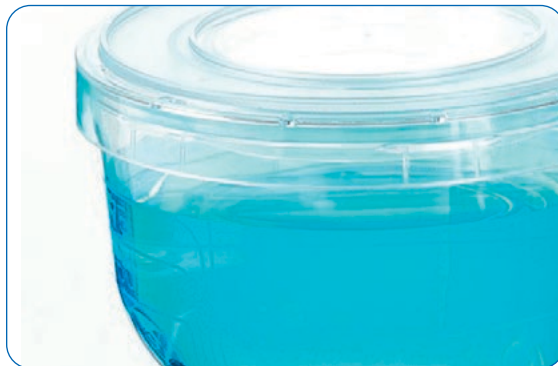
Vented lid on the device during filtration

Units can be stacked to save space in the work area