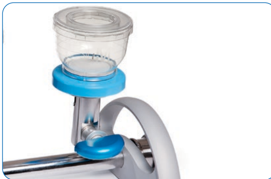
The EZ-Fit® filtration unit fits perfectly to the manifold