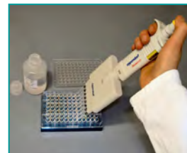
6. Enzym coupling (Coupling of an enzyme to the „sandwiches“, 25 min)