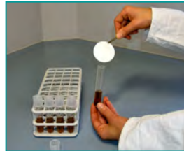
2. Filter incubation (BCYE, 36°C)