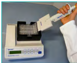
4. Hybridisation (Forming of "sandwich complexes" between specific probes and sample, 15 min)