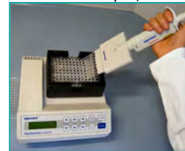
7. Washing (Removal of unbound components, 2x1 min)