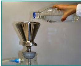
1. Sample filtration (1000 ml water, 15 min)