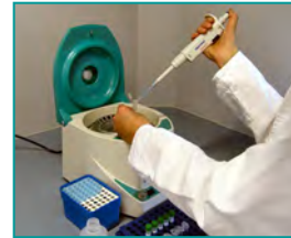
3. Centrifugation/Cell-Lysis (2 ml sample, 13.000 rpm; 37°C, 45-60 min)