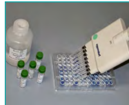
8. Encymatic reaction (Enzymatic colour reaction, 10-15 min)