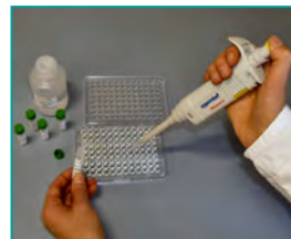
5. Immobilisation (Binding of the „sandwiches“ to an affinity plate, 15 min)