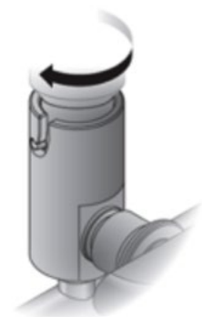
Figure 2 Bayonet fitting

The EZ-Fit® Manifold is built from highly recyclable materials like steel and aluminum and is about 99.9% recyclable by weight. After the durable product has been used for approximately ten years it can be easily disassembled in just a few minutes into its constituent materials (see Figure 1 ), thanks to quick-fit connections and recycled according to your local practices and regulations.