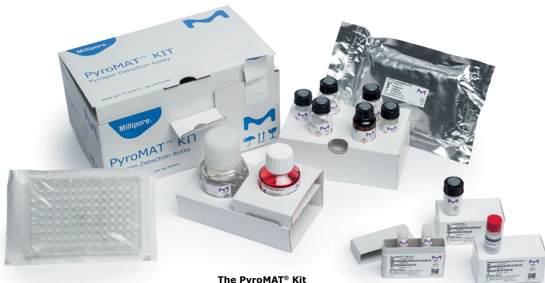
The PyroMAT® Kit