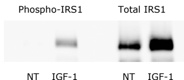
Figure 2. Immunoprecipitation/Western Blot analysis of Phospho and Total IRS1 in HEK293 cells. Non-treated (NT) or IGF-1-treated HEK293 cell lysates (200 µg) were mixed with capture antibodies to immunoprecipitate each respective protein. The immunoprecipitated proteins were separated on SDS-PAGE, transferred to nitrocellulose, and probed with biotin labeled detection antibodies. The proteins were imaged using Streptavidin-HRP and chemiluminescent substrate. (NT) non-treated lysate control; (IGF-1) stimulated lysate control.