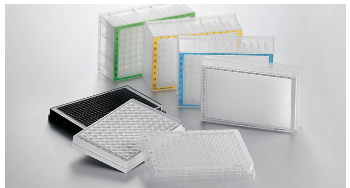
Fig. 1: Eppendorf Tubes, Deepwell Plates (right) and Polypropylene Microplates (right)