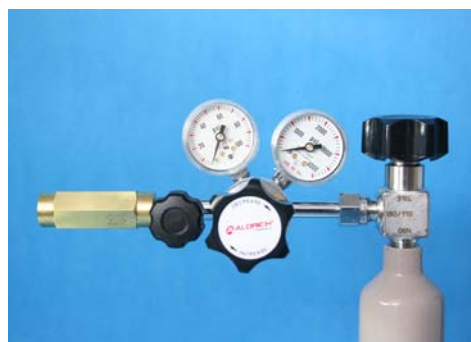
Regulator designated for non-corrosive gases with a check valve on the outlet side of the regulator to prevent back streaming of process gas.