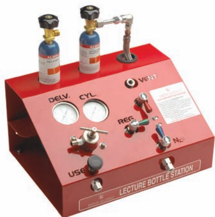
Lecture-bottle station designated for extremely corrosive gases.