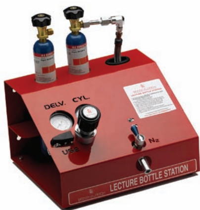
Lecture-bottle station designated for mildly corrosive or high-purity gases.