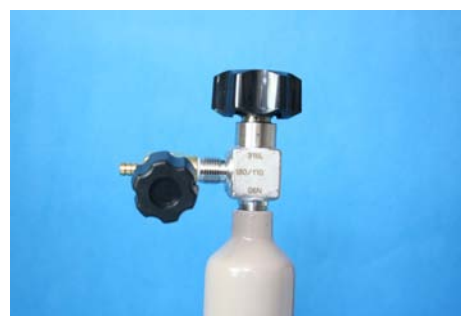
Control valve designated for mildly corrosive or high-purity gases to meter the flow of gas. WARNING: Gas-control valves do not control pressure in a closed system. Regulator or relief valves should be used to prevent the buildup of unsafe pressures that could lead to explosion.