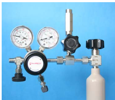
Regulator designated for mildly corrosive or high-purity gases with a T-purge assembly and bonnet vent tube.