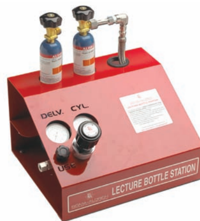
Lecture-bottle station designated for non-corrosive gases.